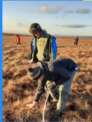
What a great day for Sphagnum planting

In July, Edale Moorland Junior Rangers were taking out their stresses on the bracken on the slopes of Kinder Scout in a practise known as Bracken Bashing to help the National Trust Rangers manage the newly planted trees in that area.