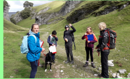
Surveying the Limestone Way

Oh, and we all had hot chocolate and marshmallows!