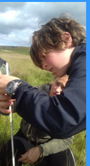
Taking MICCI measurements

Some thoughts from those at the UK residential: