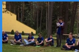
2 of our Junior Rangers had a fantastic (if tiring) time in Estonia at EUROPARC—EUROCAMP

2 of our Junior Rangers were lucky enough to join Junior Rangers from across Europe for EUROCAMP . This year it will be in Norway. Anyone up for it?