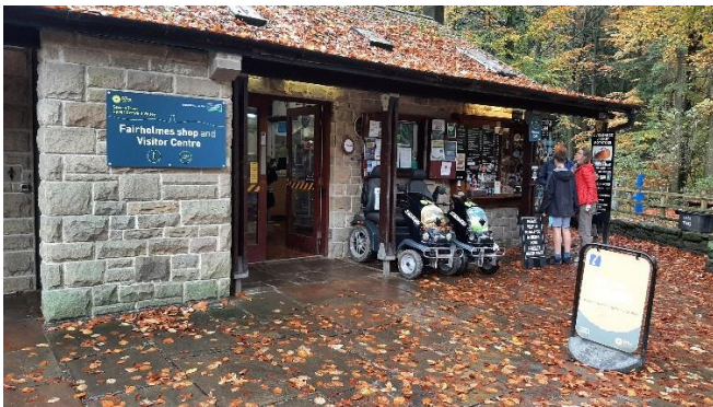
Upper Derwent Visitors Centre