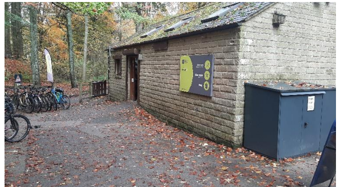
Upper Derwent Cycle Hire Centre