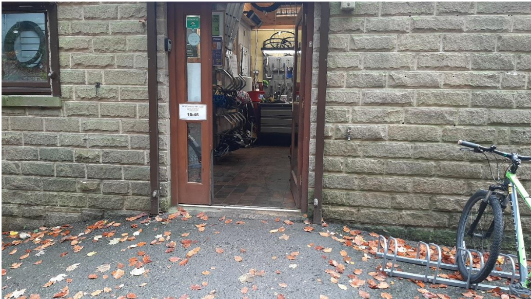
Cycle Hire Centre, the main doorway with incline/slope to the door