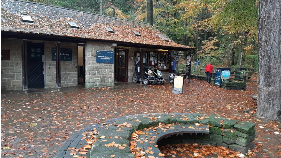
Visitor Centre, toilets and food concession.

The immediate area in front of the centre has a number of benches and an information shelter that have to be negotiated to get to the visitor centre, food outlet and toilets.