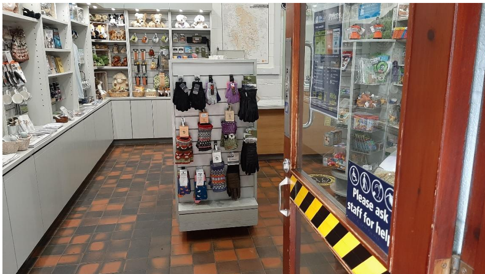
Visitors Centre retail area

Main entry doors have high contrast yellow and black warning tape.