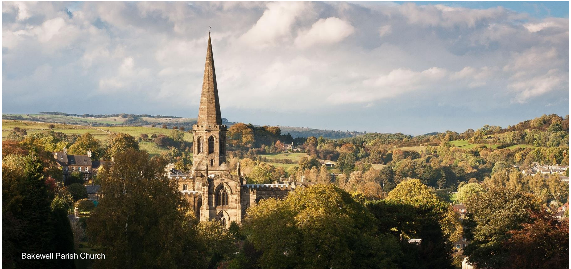
Bakewell Parish Church