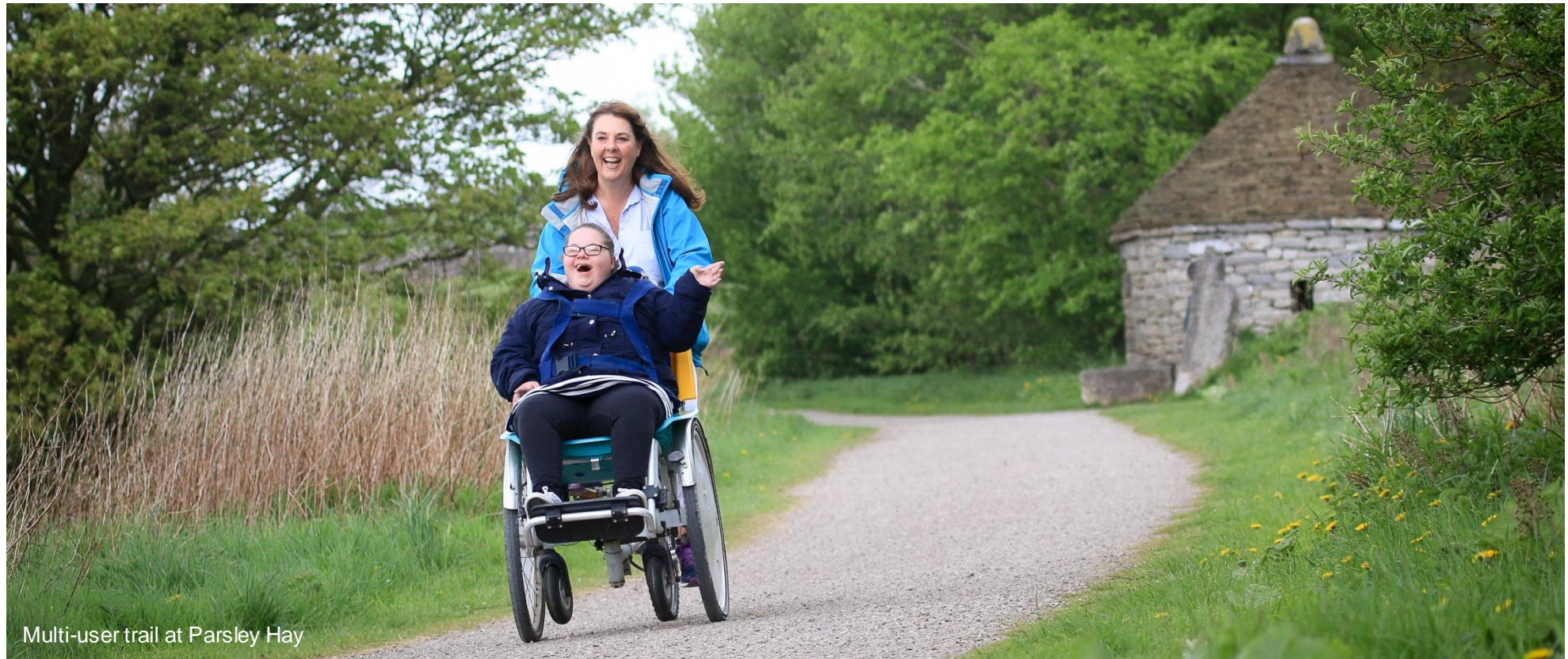
Multi-user trail at Parsley Hay

Our 2019-24 key performance indicators and targets are outlined in the following tables.