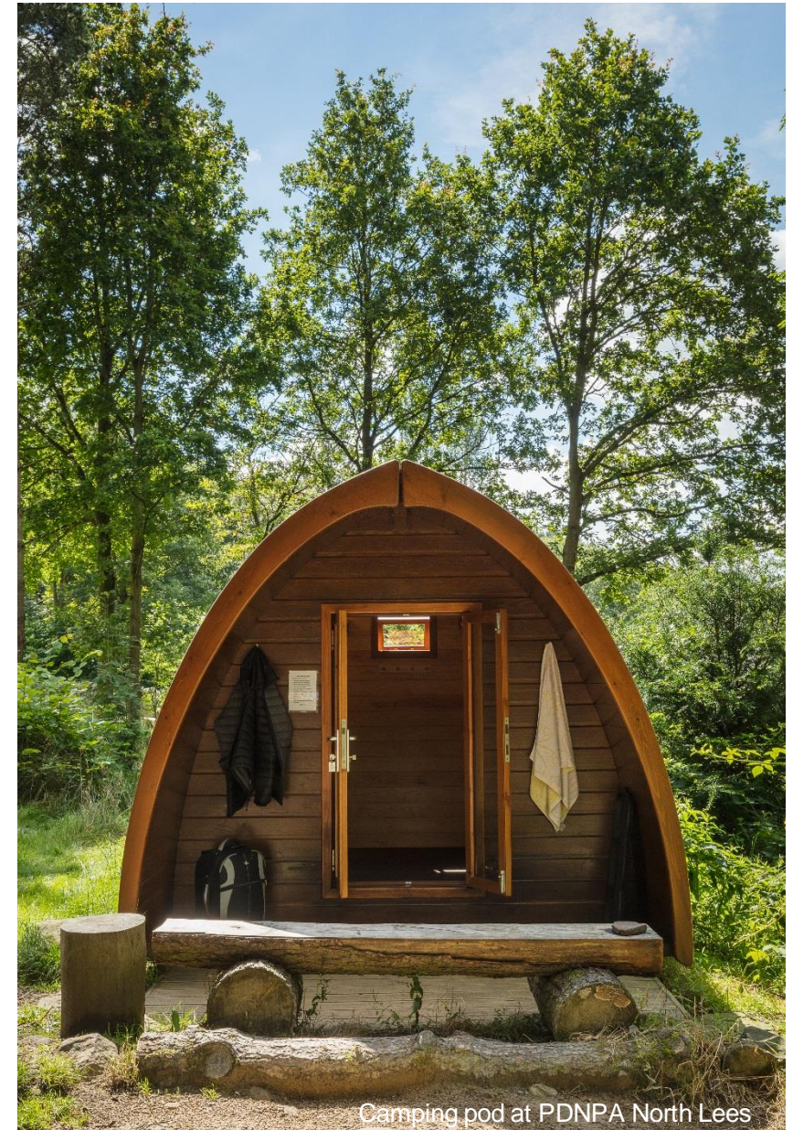
Camping pod at PDNPA North Lees