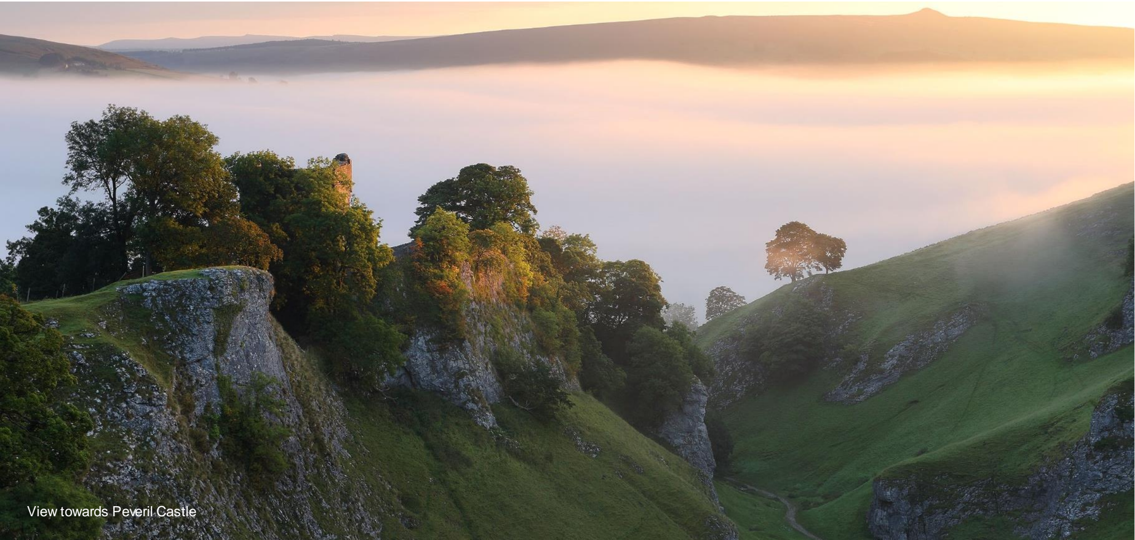
View towards Peveril Castle

(Key Performance Indicators and Strategic Interventions updated January 2021)