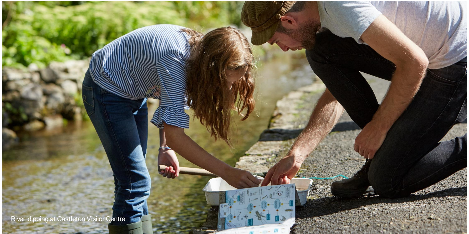
River dipping at Castleton Visitor Centre