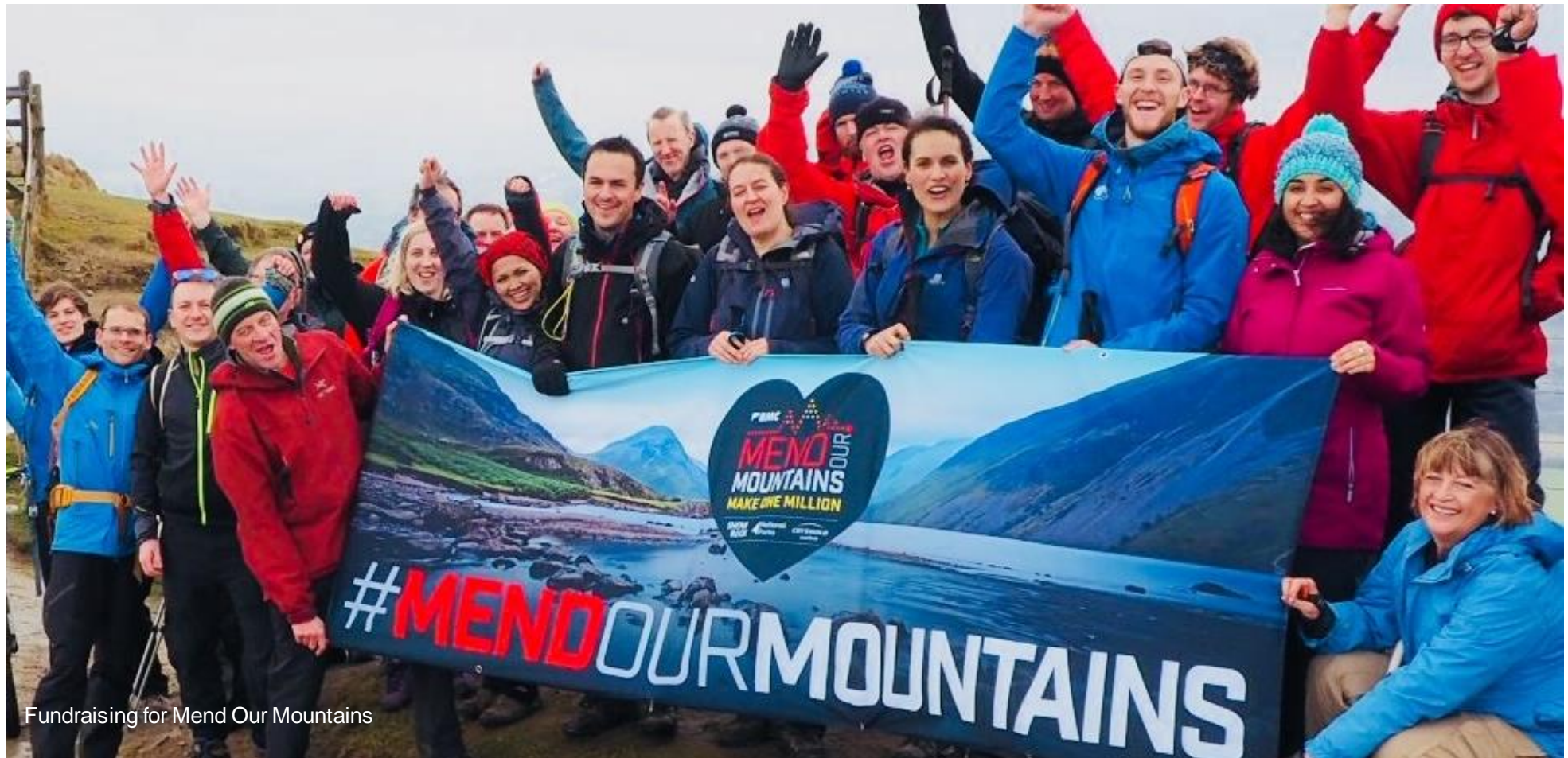
Fundraising for Mend Our Mountains