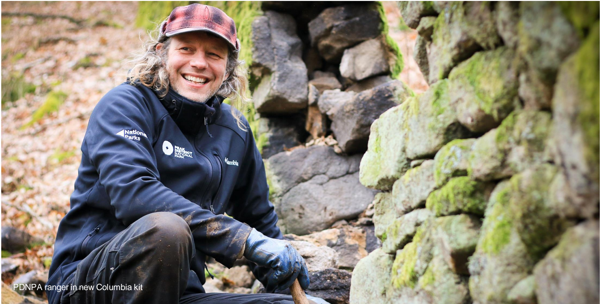
PDNPA ranger in new Columbia kit