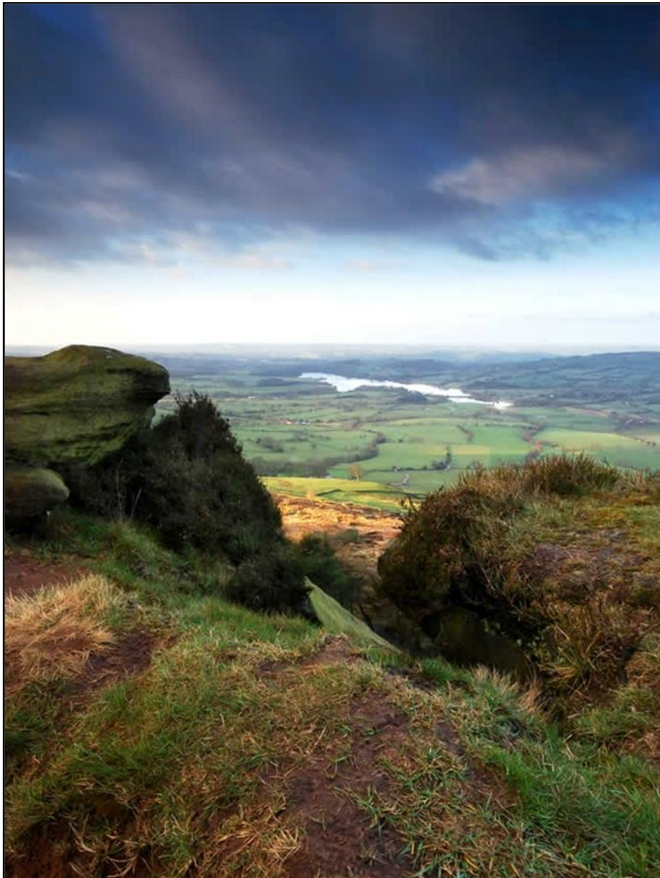
Tittesworth from the Roaches