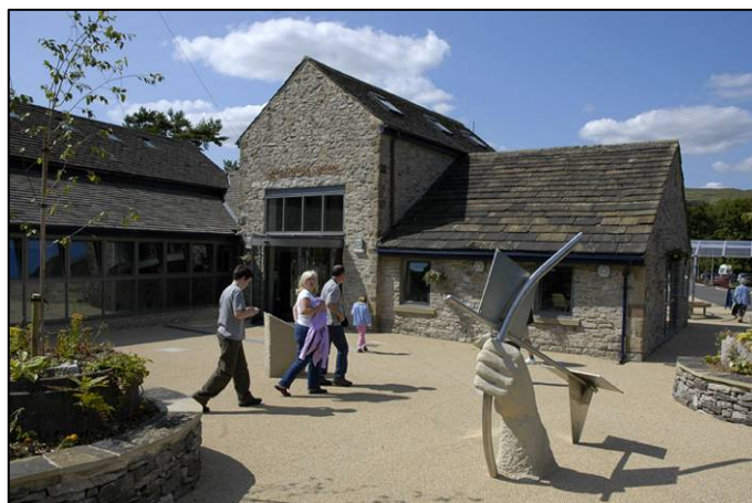
Castleton Visitor Centre

The website, www.visitpeakdistrict.com , attracted over 13 million hits during 2004 and the marketing campaigns generated additional visitor spending of £5.3 million in the wider Peak District in 2004/05.