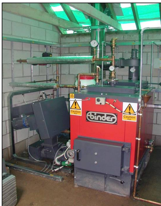
Losehill Hall's biomass boiler

Losehill Hall achieved eco-centre status in 2003, and as part of the on-going programme of work to improve its environmental footprint installed a new £50,000 Biomass heating system using renewable energy from locally sourced woodchips. This is hoped to provide up to half the Centres heating and hot water needs and cut its CO 2 emissions by up to 50 per cent.