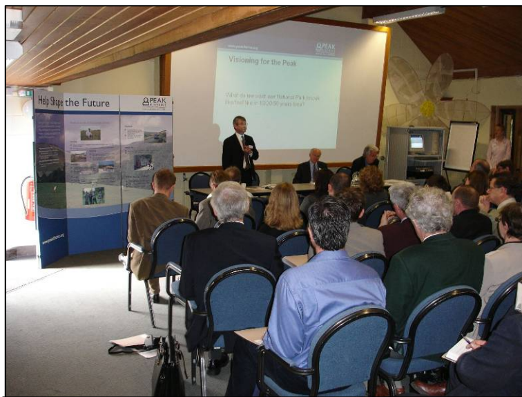
Stakeholder engagement event in May 2005

The league table puts us in 3rd place behind Northumberland and North York Moors, and we are confident that when the next round of surveys takes place on 31st December 2005, we will gain our maximum 21 points through a combination of the Planning Portal, the implementation of a new document management system and the associated Public Access module, and integrating our online payments.