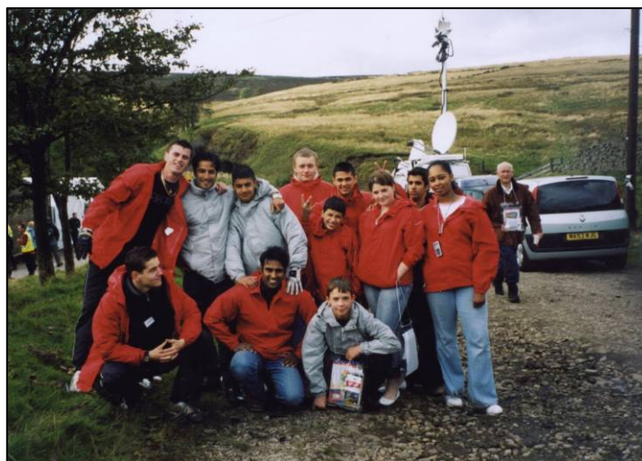
Young people from ARDIC Youth Group visiting the Peak District National Park

20 young people aged 15-16 qualified for the Peak District National Park Young Achievers Award, which they received at a ceremony on June 6, after learning conservation, countryside and first aid skills on residential courses among the hills. For many, it was their first opportunity to get out into the countryside and learn about wildlife habitats.