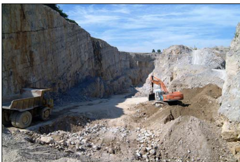
Quarrying at Longstone Edge

The decision means that the operators, Stancliffe Stone, cannot re-activate the quarries until modern environmental conditions have been imposed.