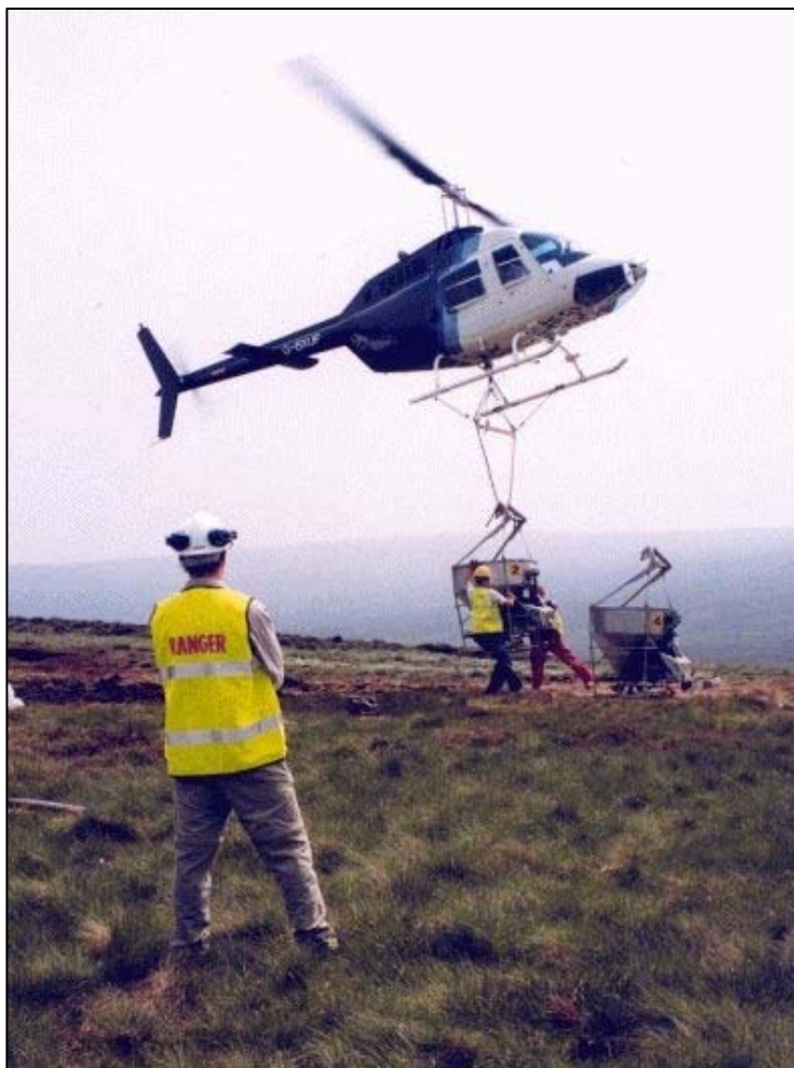
Using helicopters to restore damaged moorland

Moors for the Future – an 11 partner project - was launched in 2002 with £4.7m funding, mainly from the Heritage Lottery, to restore rare moorland and blanket bog that was severely eroded by fire, pollution and overgrazing, to carry out research and to improve recreation opportunities and understanding.