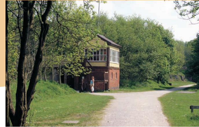
Hartington Signal box

Organised events, such as sponsored walks, need permission from the PDNPA or the DCCCS.