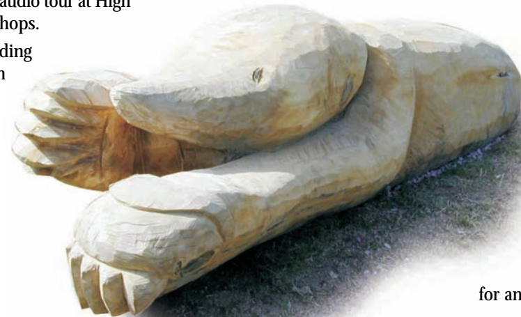
Mole carving on the Tissington Trail at Ruby Wood

Find out more by reading the Trail interpretation panels and visiting the Trails Information Centres.