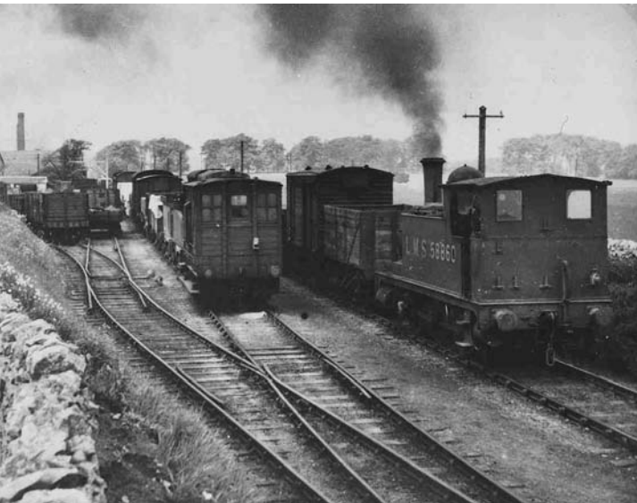
Cromford & High Peak railway, Friden.

You can walk, cycle or ride a horse on the trails all year round. Why not create your own circular route by incorporating the trails into the existing network of public footpaths, bridleways and roads, using the White Peak Ordnance Survey map, (Outdoor Leisure 24). Use circular walks leaflets available at Middleton Top and High Peak Junction Workshops Information Centres.