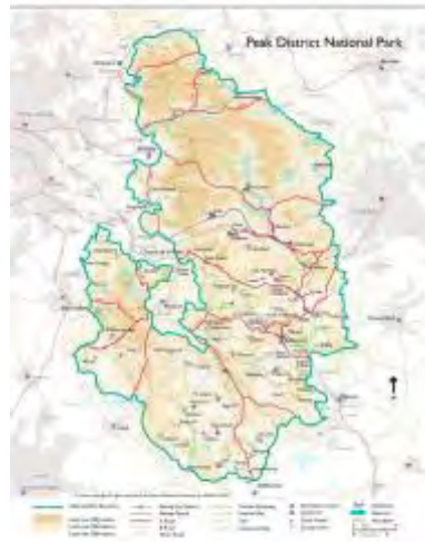
Picture I.1 Settlements in and around the Peak District National Park

Although the whole national park has the highest landscape protection in the UK, planning policy has to respond to different challenges for land use in each area. To do this the policy will look at a range of factors. These are: