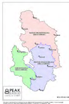
Picture B.1 Values & Challenges for the Areas of the Peak District National Park

The descriptions below are based on a wide variety of sources including comments received from the stakeholder and community workshops held during September and October 2008. A summary map and table of this can be viewed below.