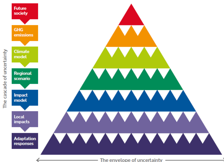
Figure 5.2: (Wilby and Dessai cited in (Bours, et al., 2014))

Other, related, uncertainties include the future: