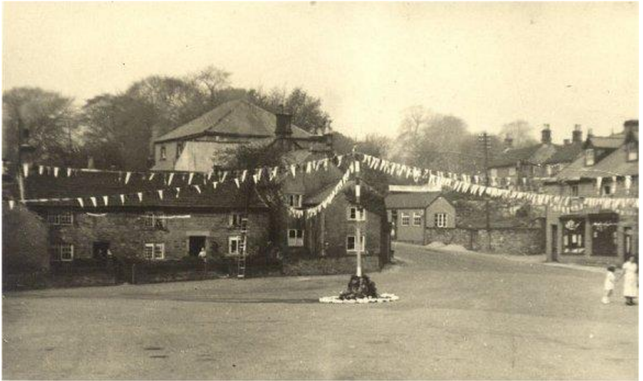
A postcard of Eyam Square in May 1935 - decorated for George V and Queen Mary's Silver Jubilee