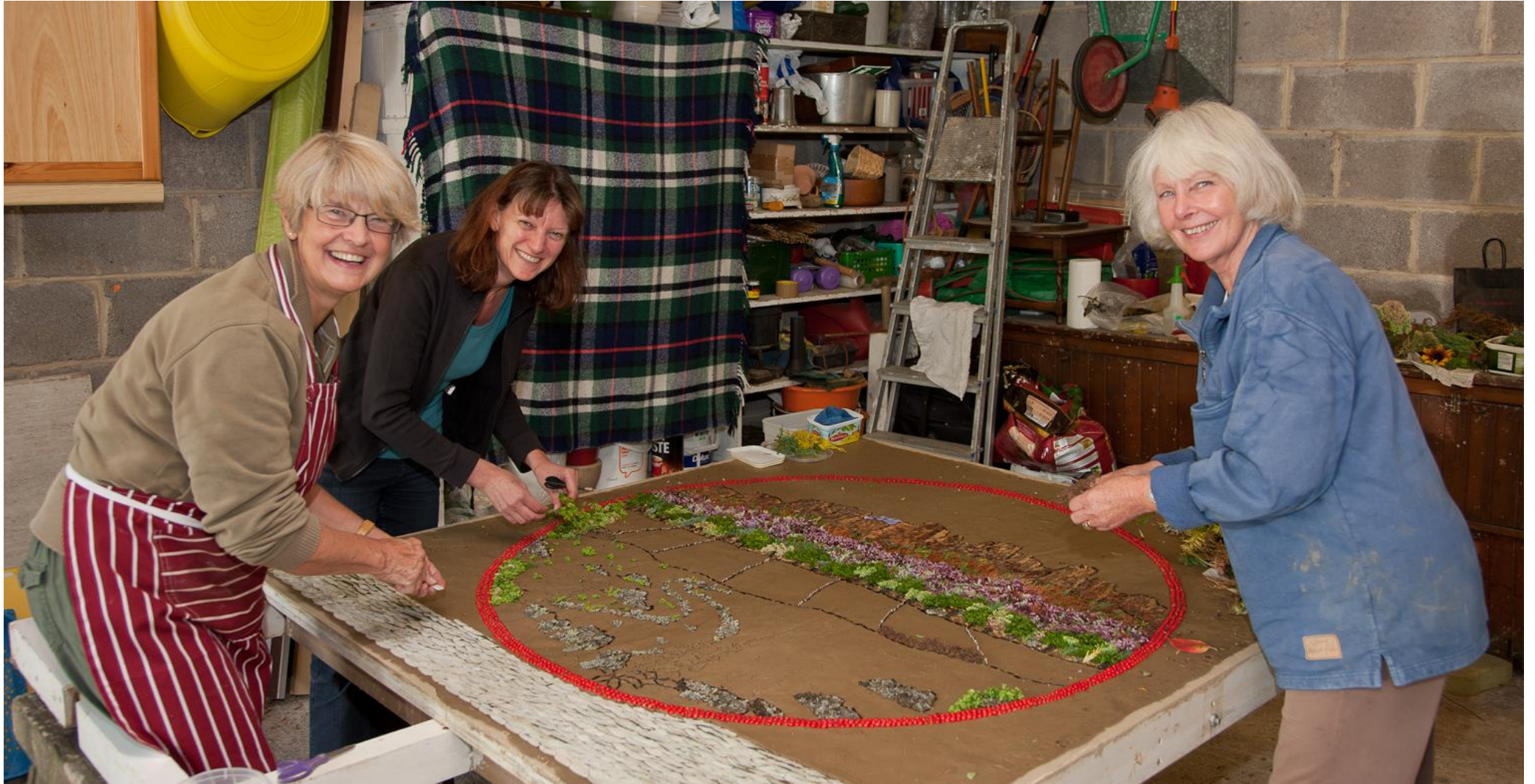
Making an Eyam well dressing