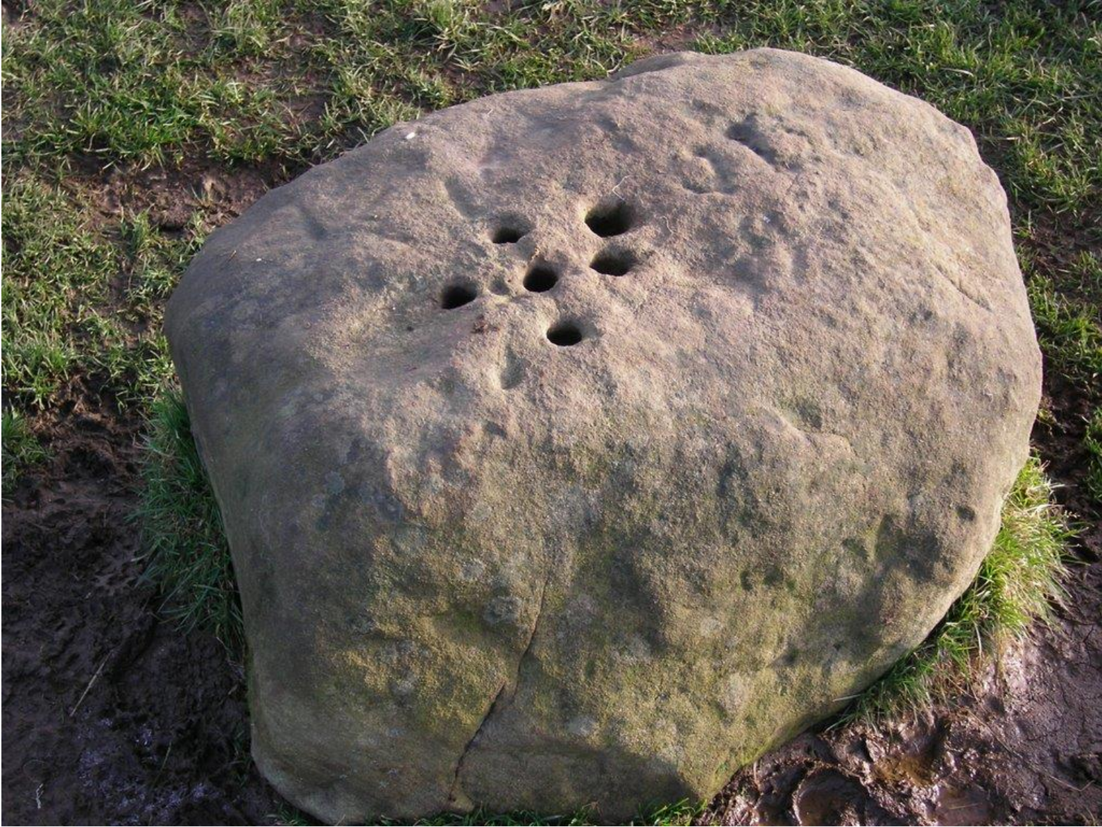
The Boundary Stone (also known as The Coolstone)