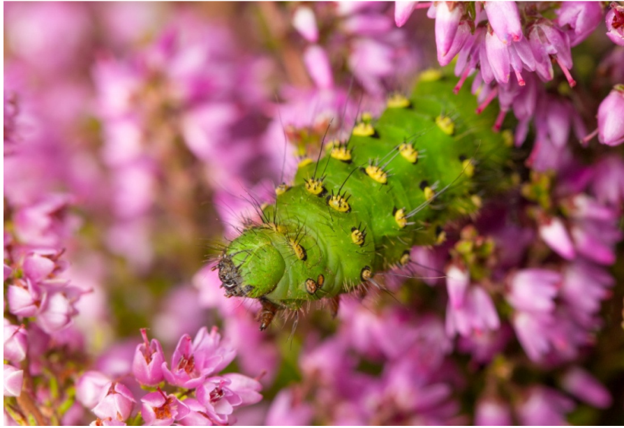
Emperor moth caterpillar

Today I have brought along a cocoon of the emperor moth, which can be found across these moors. In late summer you might find one of the large green caterpillars of this species trundling across a footpath before it spins its silk cocoon amongst the heather. We can get some pretty intense winter weather in the Peaks and when the moors are buried under snow it always amazes me to think of the emperor moth pupae enduring the elements until they emerge as adults in spring