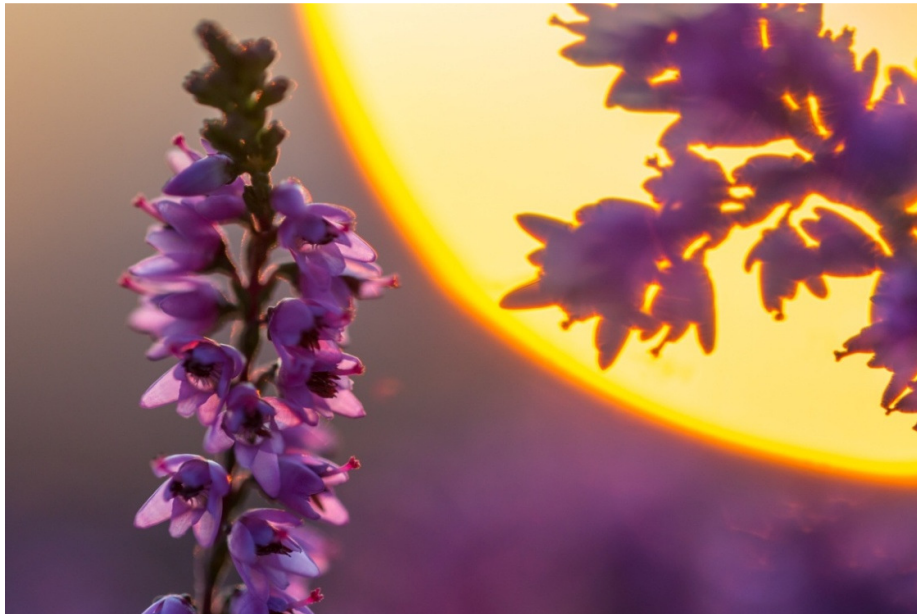
Ling heather sunset

Nature provides me with an endless array of fascinating subjects and I am confident that I will never tire of photographing them.”