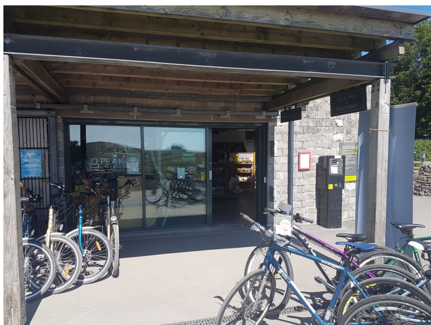
The main entrance door leading to the counter and retail area