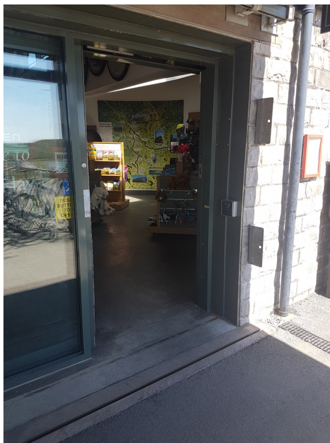
Looking through the main door in to the centre