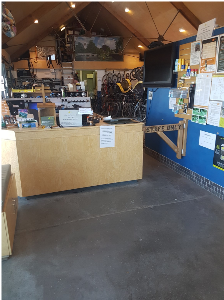
Main counter to the left of the main door.