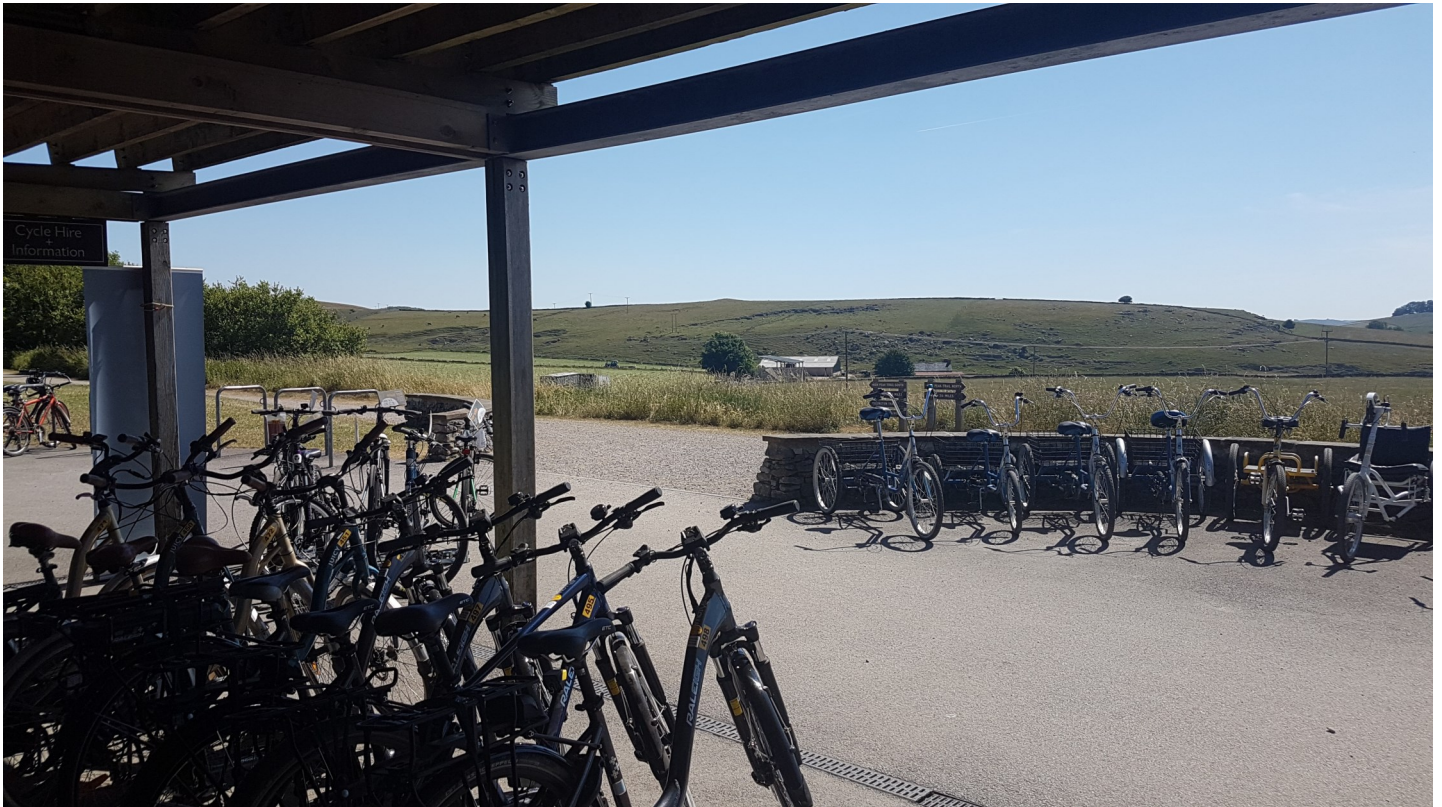
Looking over the trail and views from the centre