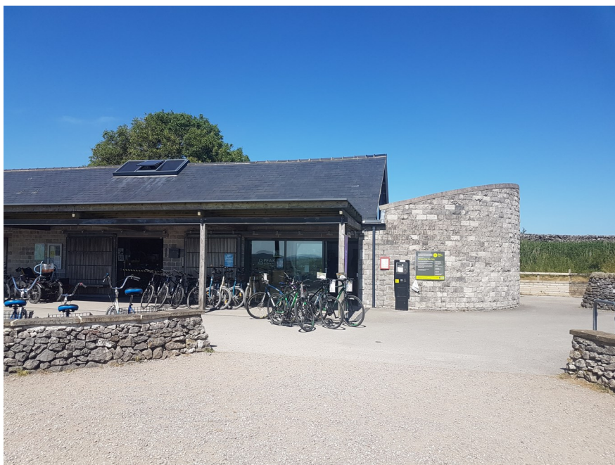
Level surface around the centre