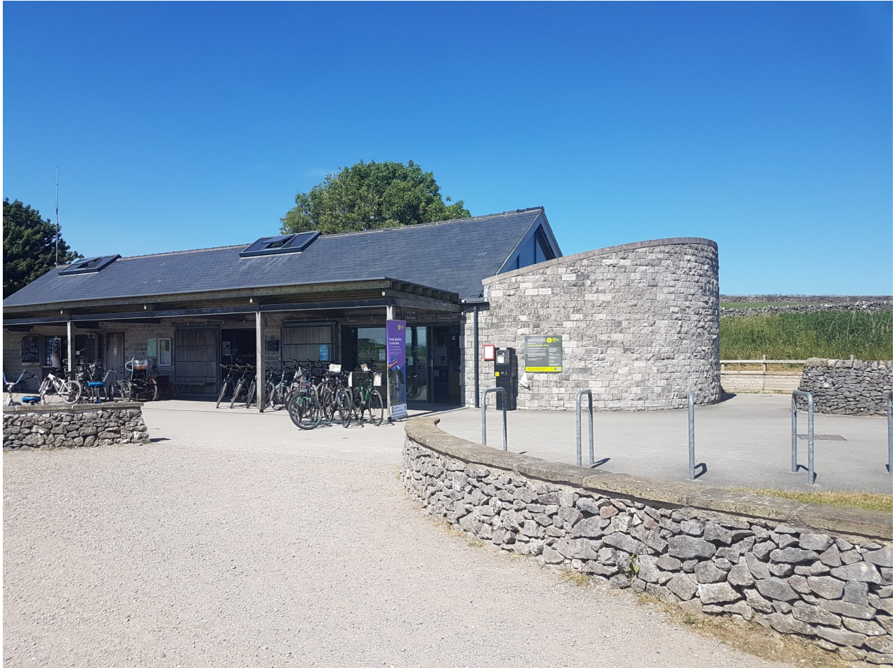
Parsley Hay Cycle Hire Centre