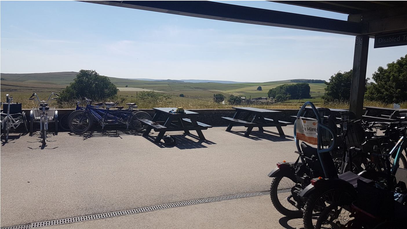
Outdoor seating and views from the centre