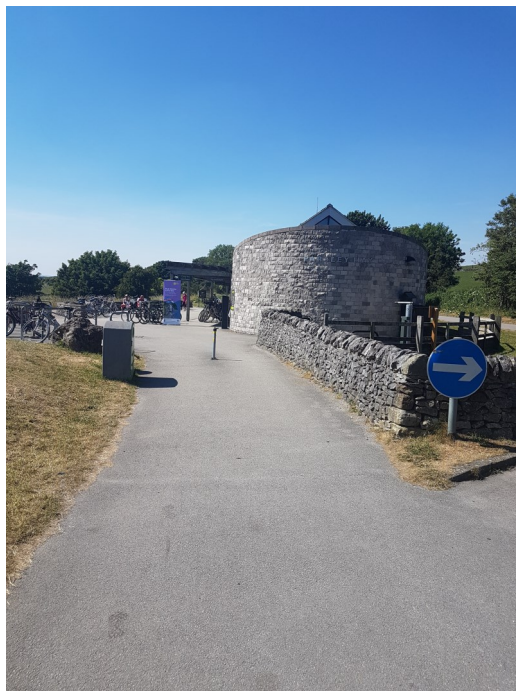
Pathway from the car park to the centre

The car park surface is tarmac with wide level path leading right up to the entrance. There is no street lighting within the car park as the cycle hire facilities are only available during day light hours. There is one car park ticket machine just outside the entrance to the cycle hire building which is 35 metres from the blue badge parking bays. The 'pay and display' machine is at a high level and so staff on duty in the cycle hire centre can also issue parking tickets if required. Parking is free for blue badge holders, please display the badge.