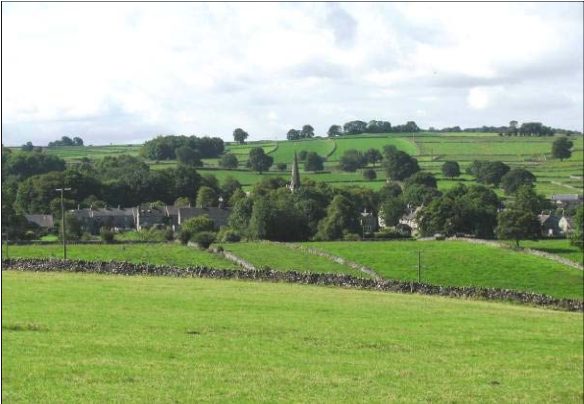
P10.1 Monyash village surrounded by its fossilised medieval field system

10.4 As part of this Appraisal, the Conservation Area boundary was extended to include part of the surviving medieval strip fields that surround the settlement and provide its context, as shown in Figure 14.