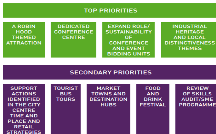
FIG 9: TOP PRIORITIES

The top priorities identified for Nottingham and Nottinghamshire are: