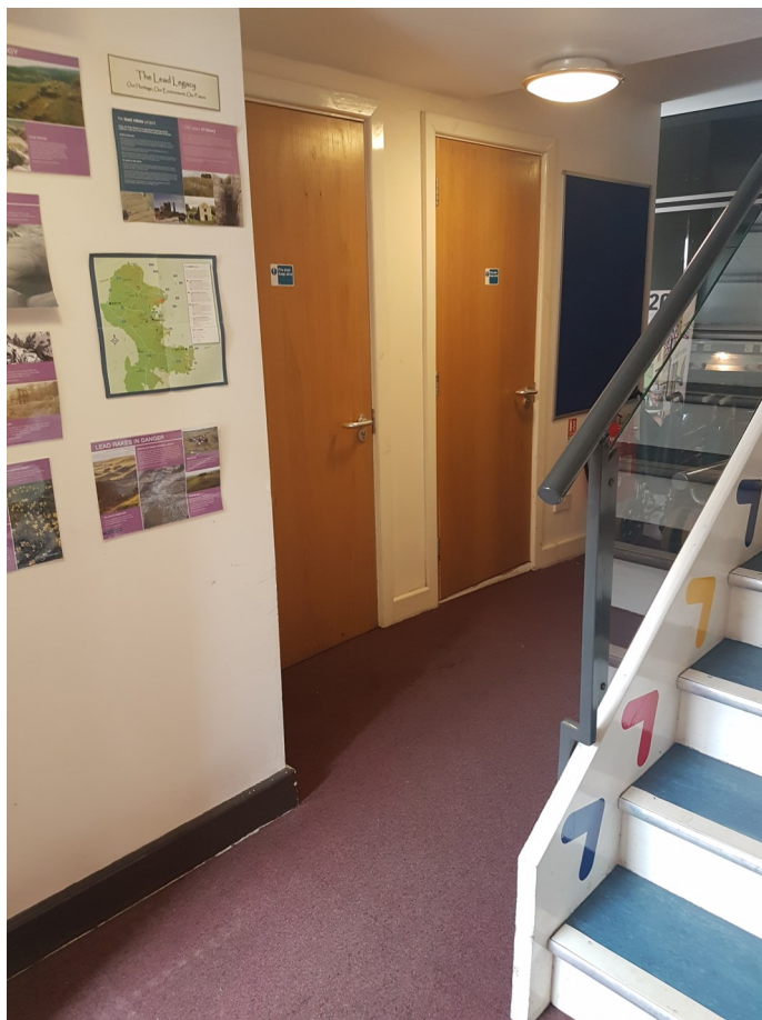
Rear of centre. Access to lift on lower floor and stairs to Mezzanine floor.