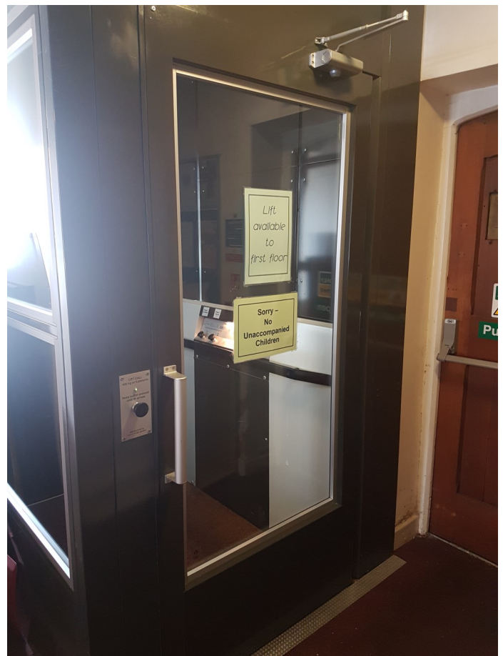
Rear of centre. Lift on lower floor to Mezzanine floor. Also fire exit.