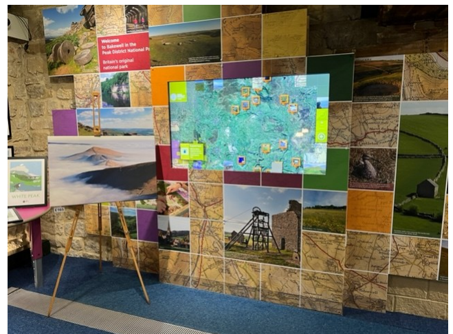
Mezzanine floor - digital touchscreen