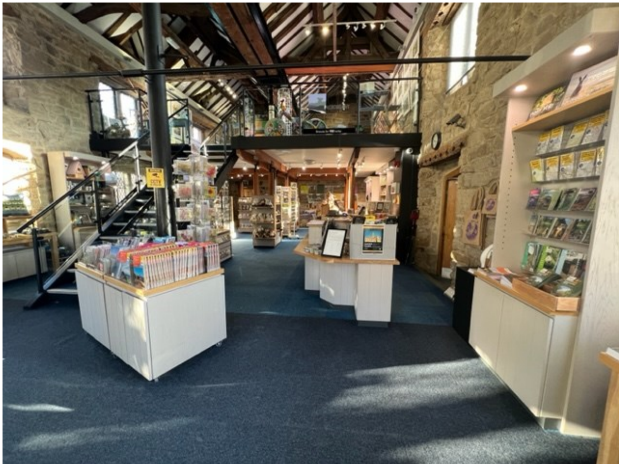
Inside centre. Flat, carpeted area to main counter and main stairs to Mezzanine floor.