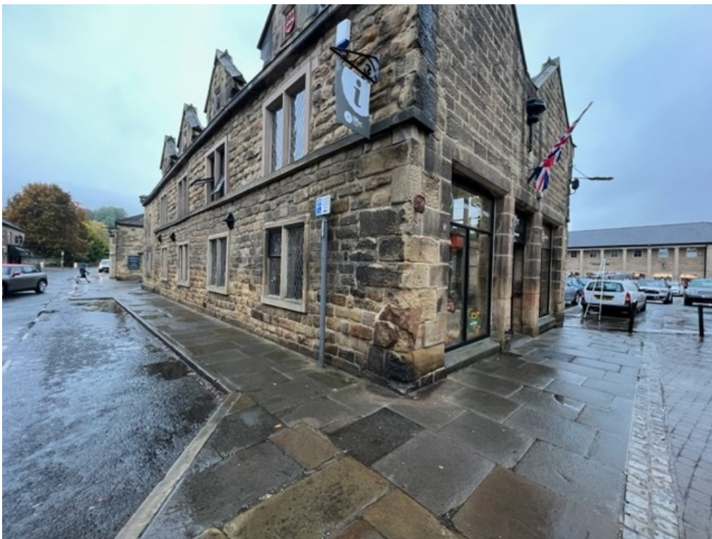
Bridge Street disabled parking bay adjacent to centre and Market Place car park.

Arrival Path to the main entrance: There is level access from the street to the main entrance.