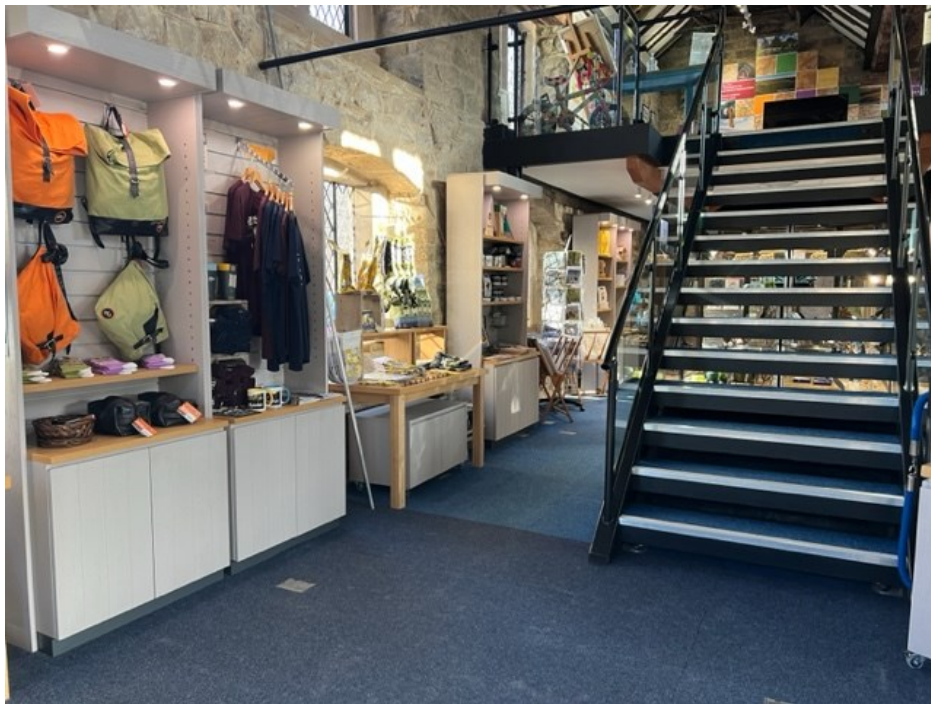
Stairs to Mezzanine floor