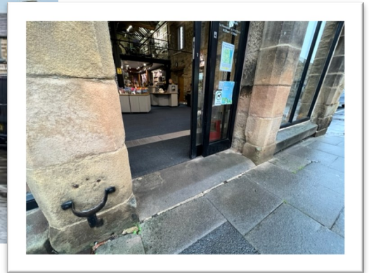
Access to centre, small incline at door way.