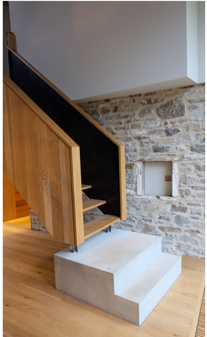
Contemporary design in a historic building - a simple palette of materials, including concrete, finished to a high specification in a barn conversion. (© CE+CA Architects)