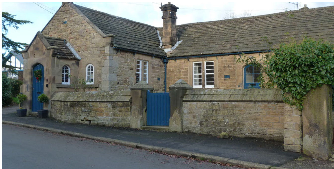
This former school is now a domestic dwelling, but retains its institutional character.