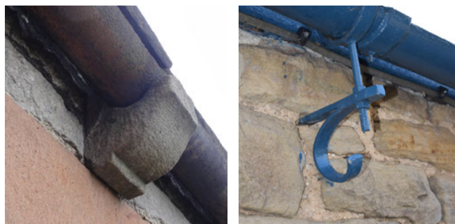
Left: Stone support for a cast iron gutter on a historic barn. (© Oldfield Design Ltd). Right: Metal bracket gutter support on a former smithy. (© PDNPA)

5.79 'Storm-proof' type window frames would be inappropriate for a historic building, particularly a listed building. On barns or other utilitarian buildings the detailing of new timber windows should be robust and simple - a fussy or flimsy appearance should be avoided as it will be out of keeping with the historic character. On listed buildings projecting timber sills would generally be inappropriate – an assessment of the suitability of the existing stone sill needs to be made.