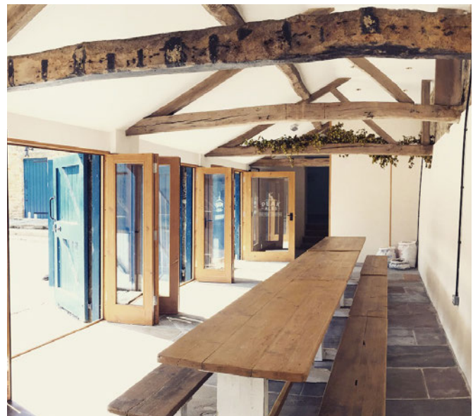
Large openings glazed to full height retain the character and bay arrangement of this former cart shed, now a Visitor Centre.

5.51 Where inappropriate modern windows and doors exist, replacement of these with a more suitable alternative is likely to enhance the building and will be encouraged. New windows and doors should be of an appropriate design for the building. For example, in order to underplay the appearance of inserted frames and glazing in traditional hay-loft openings, plain un-subdivided windows with the frames set back within the reveal (a minimum depth of 100mm) can be an appropriate treatment. Ground floor windows of stables and cowhouses often have inward-opening hopper windows with fixed glazing below, and this may be an appropriate pattern to follow.