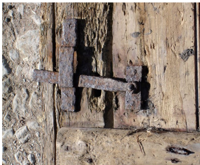
A simple iron latch on a historic door.

5.78 New windows and doors should be timber or metal (PVC-U is not appropriate). Where cast iron windows are part of the original design concept of a building, new windows should reflect this. Modern powder-coated aluminium may sometimes be acceptable for large-format openings.