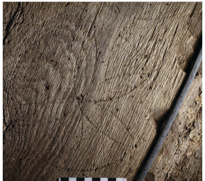
Hexafoil inscribed on a 16th-century cruck blade in a barn.

5.40 Other original internal features, such as decorative treatments and finishes, panelling, graffiti, apotropaic marks, carpenters' and masons' marks, etc., should be retained wherever possible. Cleaning (only if really necessary) should be restricted to gentle brushing to avoid damage to these delicate traces.