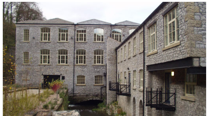
A mill converted for residential use. All openings are original, and a small number of new balconies respond to the industrial character of the building.