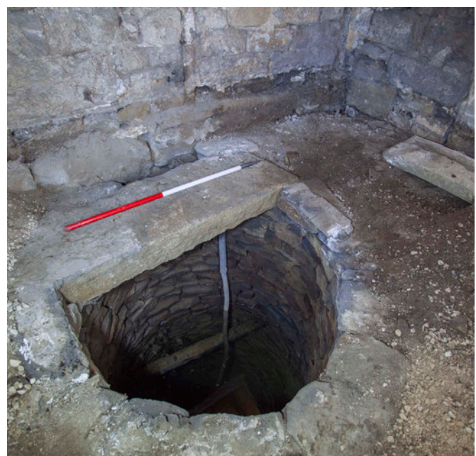
A well revealed below the flagstone floor inside a building.