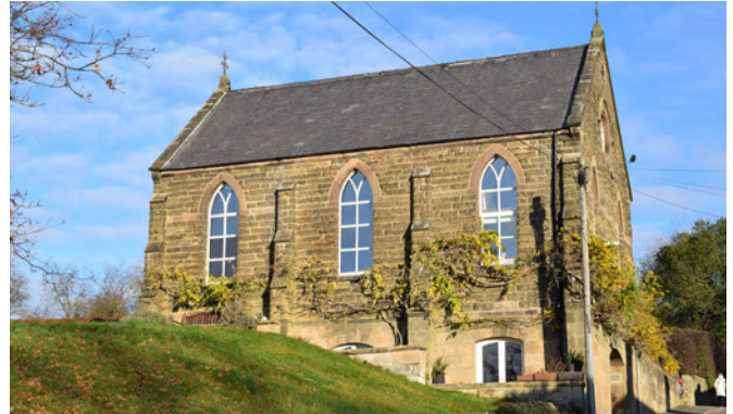
A converted chapel retains the strong symmetry created by the windows. On the elevation facing the street, the original stained glass has been retained in the upper portions of the new windows.