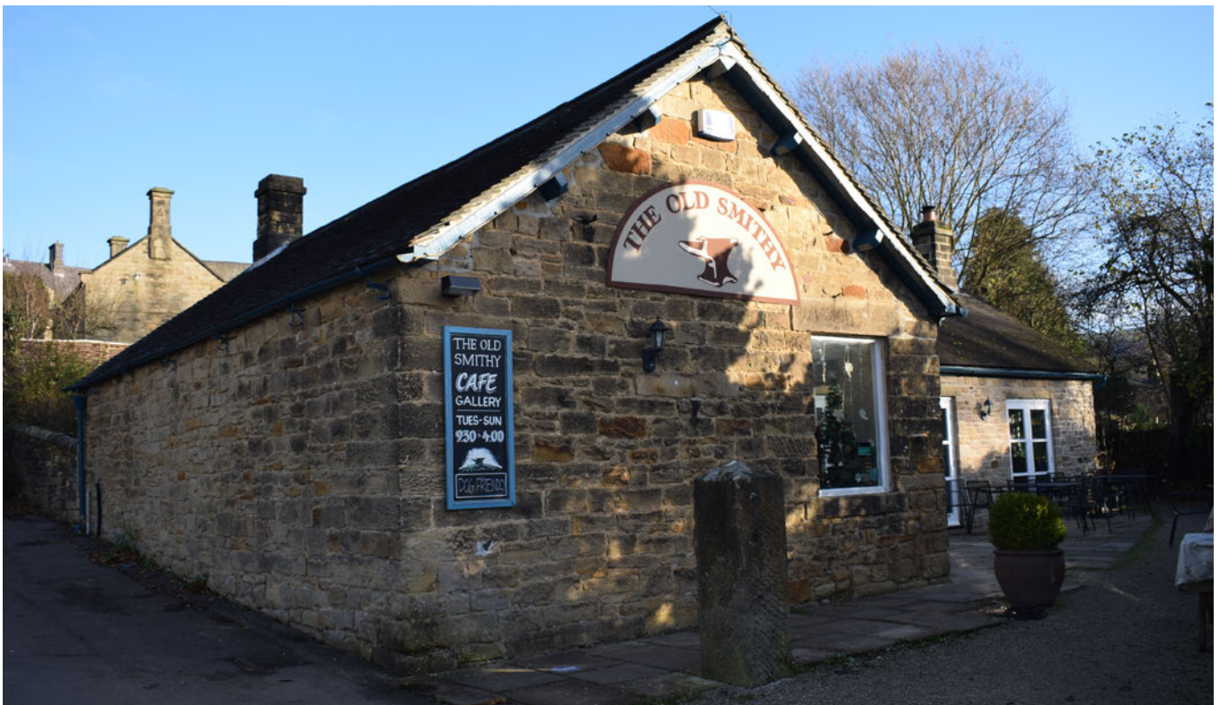
Former smithy converted into a café – the plain façade on the street frontage has been retained.