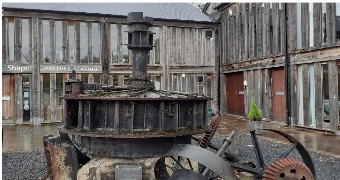
Creative new 'hit and miss' structure reflecting the character of a former timber drying shed, converted for use as office space.

5.65 Contrived new external elements, such as datestones, should be avoided on the principal historic building, as these can blur its history and appear overly domestic.