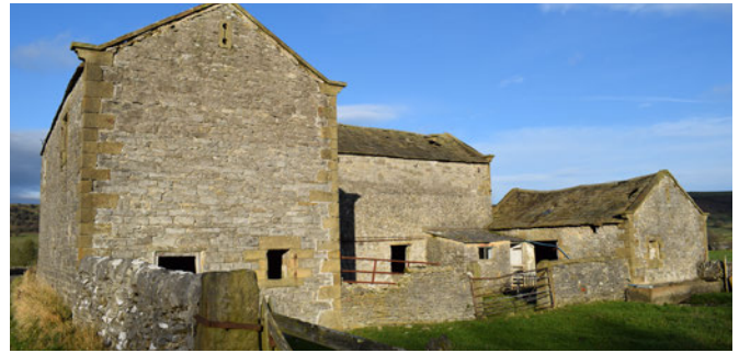
A Peak District outfarm, with buildings around a small yard. There are few openings in the upper parts of the elevations and there is very little surrounding curtilage.

5.14 Schemes should work within the shell of the existing building, avoiding additions or extensions. Where room heights are low, for example, first floor rooms can be partly contained within the roof space as an increase in eaves or roof heights may change the character of the building.