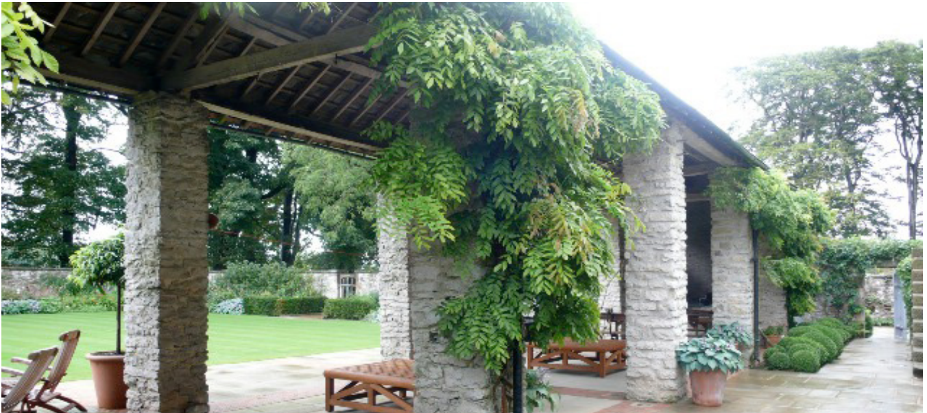
Open-sided barn converted for outdoor domestic use. (© Bench Architects)