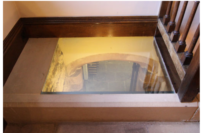
A glass panel in the floor brings borrowed light into a converted basement. (© Bench Architects)

5.50 Consideration should be given to other means of bringing light into the building, for example, using 'borrowed' light to reduce the need for new openings or rooflights. The conversion of buildings such as mills, with large floorplans, will require careful design to bring light into the core. Rooflights can be used to conceal sun pipes that can bring lighting into other parts of the building.