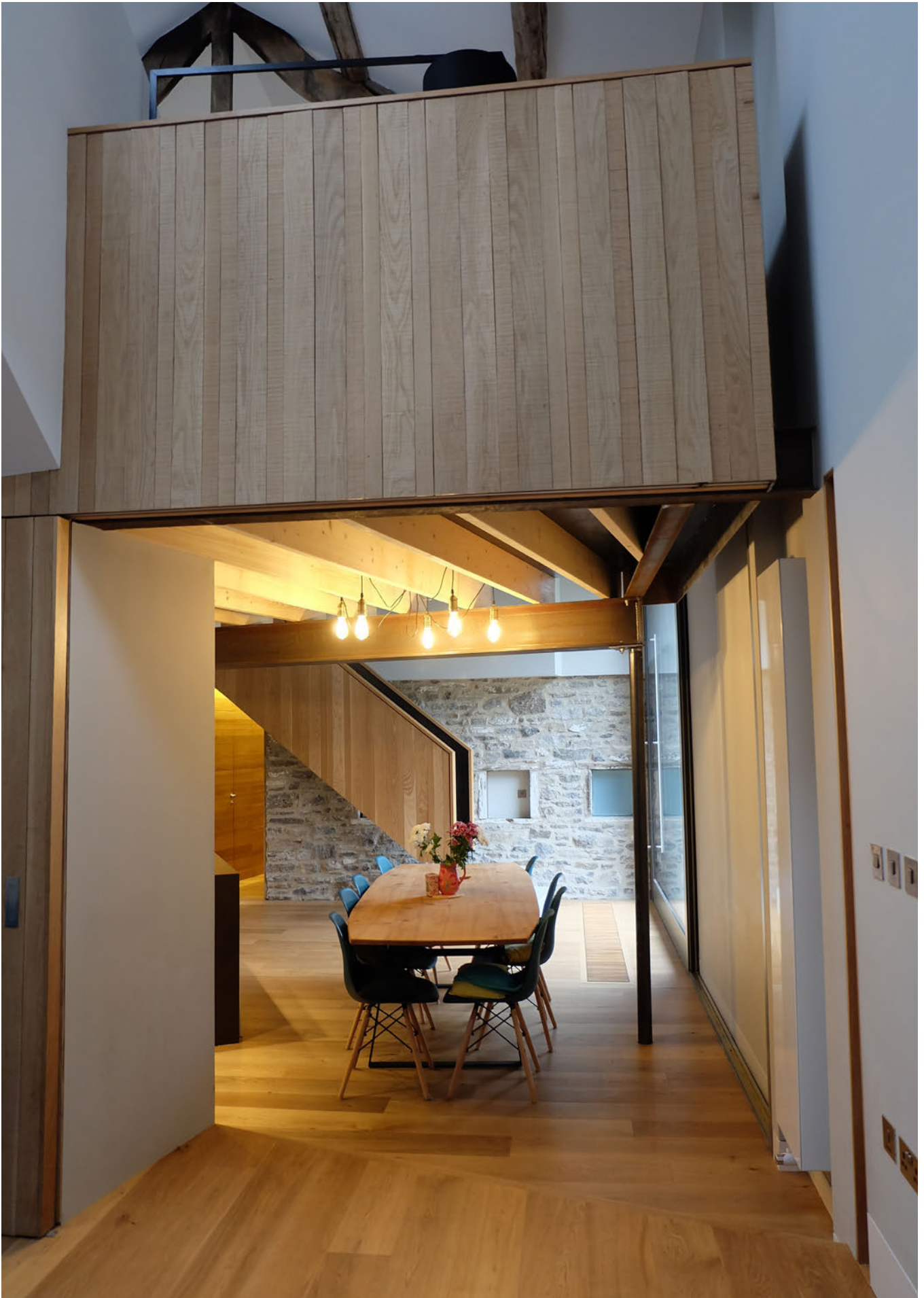
Barn converted into dwelling. (© CE+CA Architects)