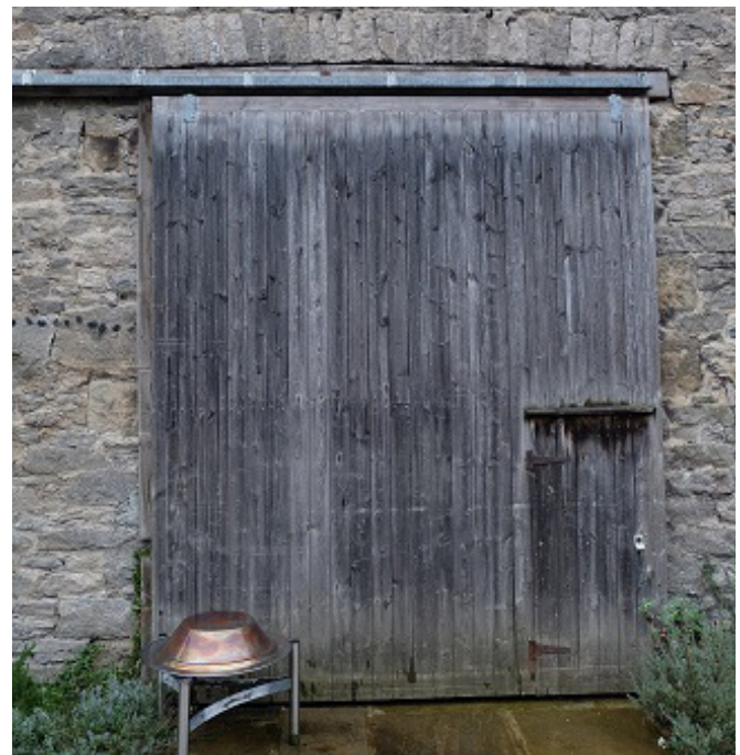
The 20th Century sliding door on this threshing opening, although not part of the original building, has been retained and can be closed to cover the new glazed opening behind it. This maintains the agricultural feel of the converted barn and helps to tell part of the building's history. (© CE+CA Architects)