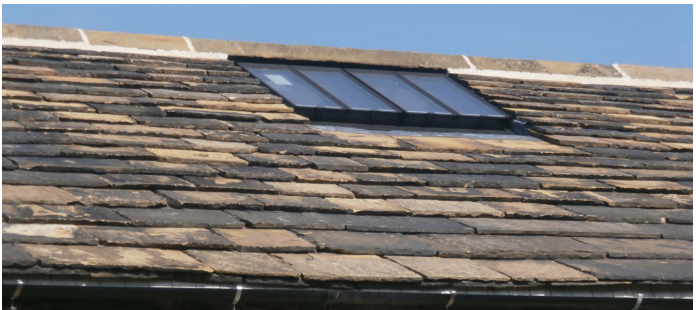
Industrial roof light set flush into a new stone roof along the ridgeline of this converted barn. The agricultural feel of the barn is maintained.

5.49 In some cases it might be more appropriate to insert a more industrial form of rooflight, for example a single larger unit of 'patent glazing' along a ridge line. This may be preferable to pockmarking a roof with several individual openings.