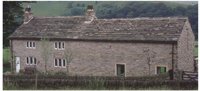
Barn adjoining the farmhouse has been converted to domestic use but retains a distinct utilitarian character.

5.43 Chimney stacks should be avoided where these did not exist historically. In the exceptional cases where a new masonry chimney is appropriate, it should be simply detailed to reflect the local tradition.