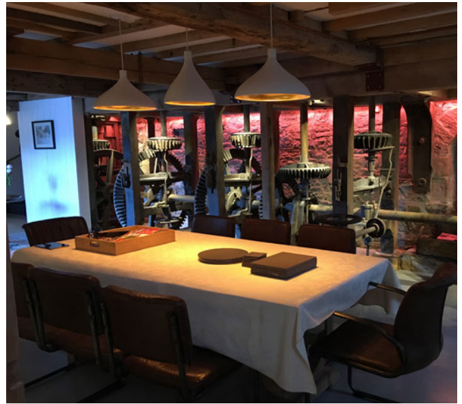
The water-power machinery retained in this mill conversion.