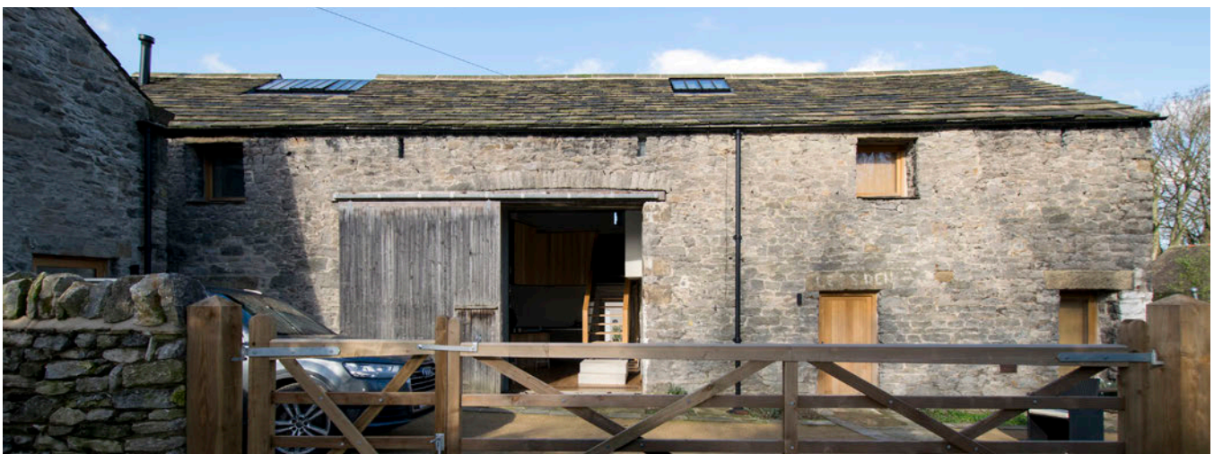
A barn after conversion to domestic use. The retention of the large sliding door and the careful use of existing openings with simple woodwork and internal shutters helps to maintain the agricultural character of the building. The interior is very modern but responds to the historic uses of space. (© CE+CA Architects)