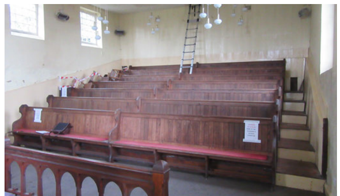
The simple open interior of a disused Methodist chapel with pews and other internal fittings. These spaces can pose design challenges that require a creative and sensitive response.