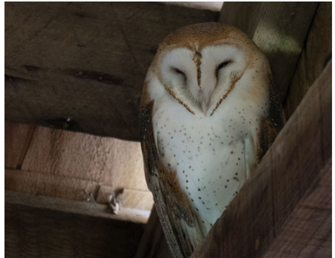
Barn owl.