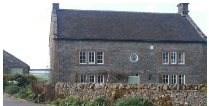
A 'light touch' glazed link between a house and converted barn – both buildings are listed. (© PDNPA)