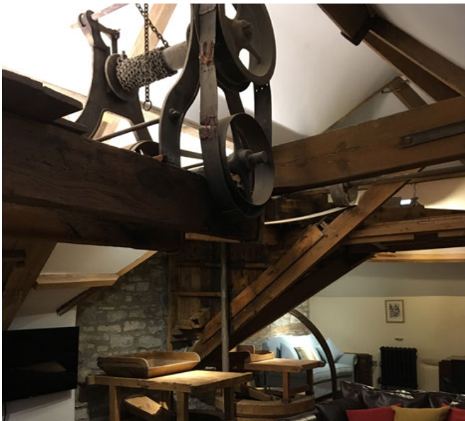
Machinery retained in its original position and creating a striking feature of interest in this former 18th-century corn mill.