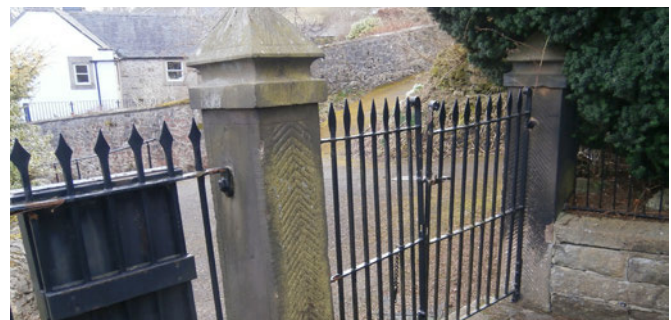
Gate piers and iron railings forming the boundary of a chapel curtilage.