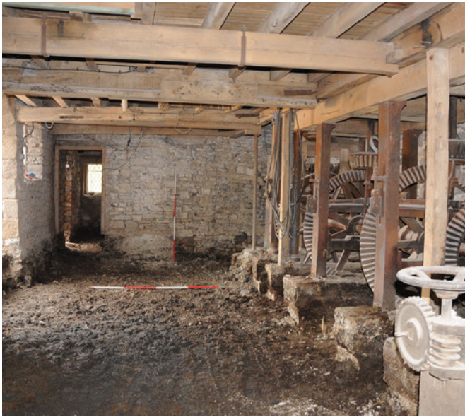
Water-power machinery in situ during archaeological recording of a mill before conversion.