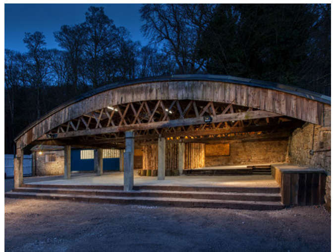
An early 20th Century open-sided barn, with Belfast trusses, converted into a covered outdoor education space. The simple design and utilitarian materials reflect its former agricultural use.