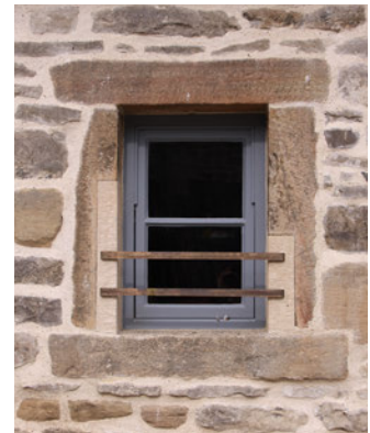
A like-for-like replacement of an historic window, including stonework repairs and new ironwork, based on evidence from the existing openings. (© Bench Architects)