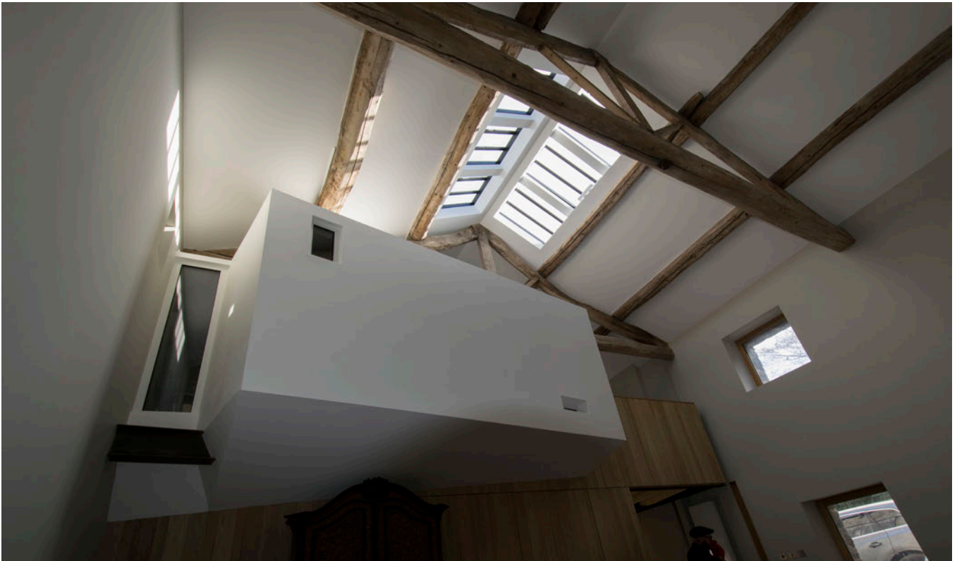
New interior structures in this barn conversion float free of the historic fabric and keep the full height space legible. (© CE+CA Architects)

5.73 Fire prevention systems may need to be specially adapted for historic building conversions. It is preferable to install a radio alarm system (to avoid wiring). The use of sprinkler or water mist systems can sometimes be used to avoid fire compartmentation and the subdivision of large internal spaces, particularly at first floor level in barns. Some historic doors can be adapted to comply with fire safety regulations, for example by the use of intumescent (fire retardant) paints and strips. It may be necessary to alter the design of existing windows for fire escape purposes, and the implications of this should be considered at an early stage.