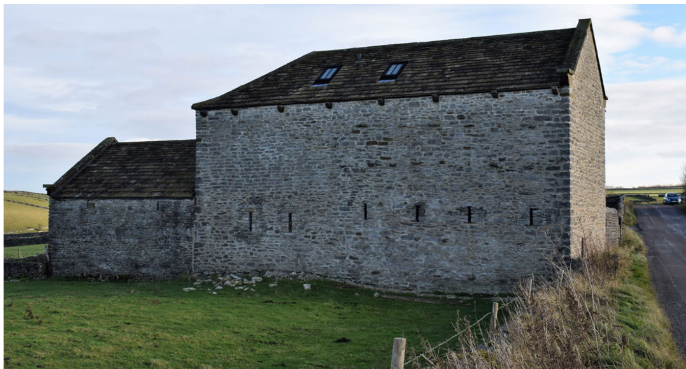
A barn after conversion – the solid-to-void ratio has been maintained. The only alterations on this elevation are two conservation rooflights and two additional vent slits to allow additional light to the interior. All the other original openings are on the opposite elevation.