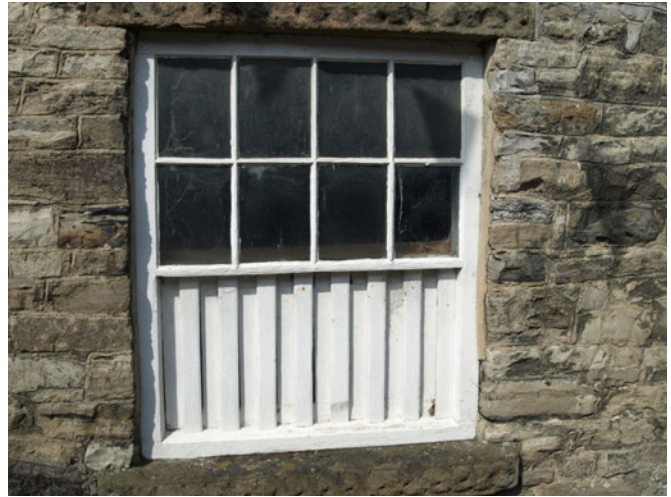
A traditional window with glazed upper and 'hit and miss' vents below.

5.33 The way in which doors open and are hung are important features, and should be retained. Doors may be inward or outward opening, depending on the use of the spaces within and the detailing of the door