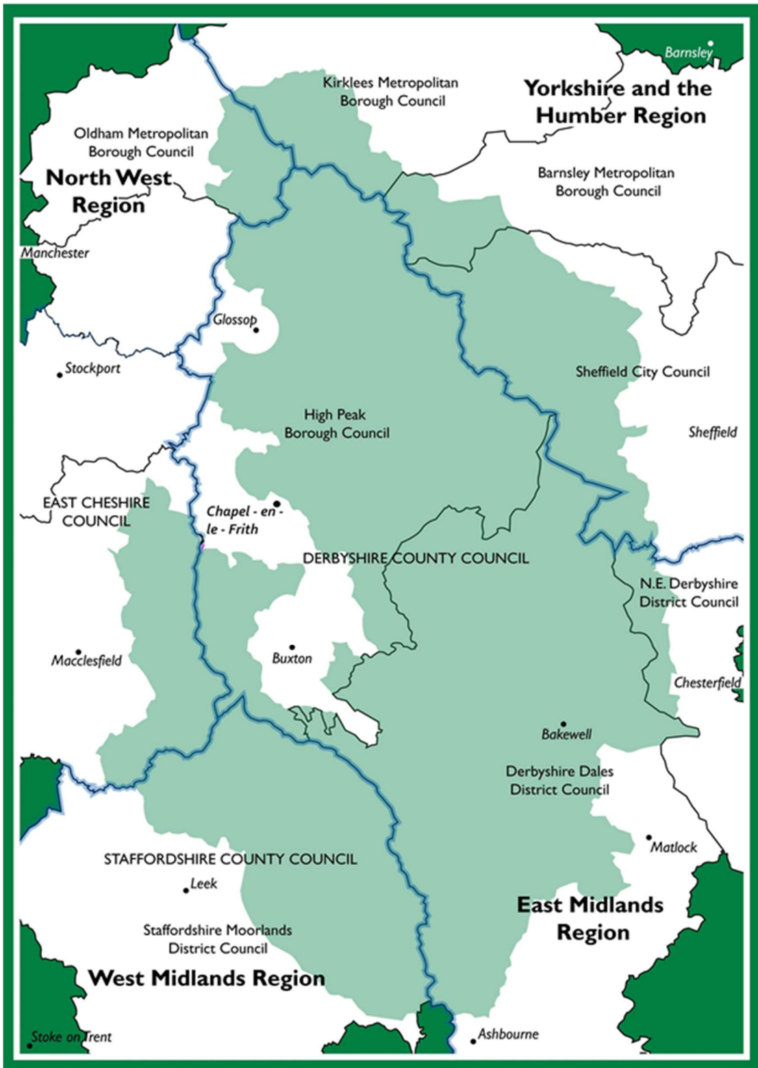
Fig 1. Local Administrative Context Showing Constituent and Neighbouring Authorities